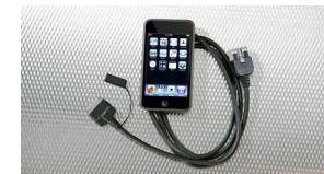
Interface Kit for iPod® $299 Installed MSRP*