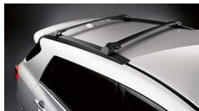
Roof Rack $350 Installed MSRP*