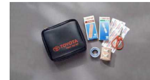
First Aid Kit $29 Installed MSRP*