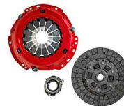
TRD Performance Clutch $650 Parts Only MSRP**