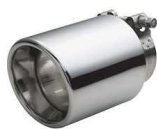
Exhaust Tip $180 Parts Only MSRP**