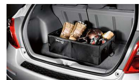
Cargo Tote $40 Installed MSRP*