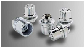
Alloy Wheel Locks $67 Installed MSRP*