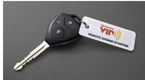
Remote Engine Start $529 Installed MSRP*