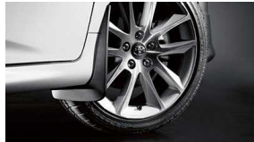
Mudguards Front (2pc set) $99 Installed MSRP*