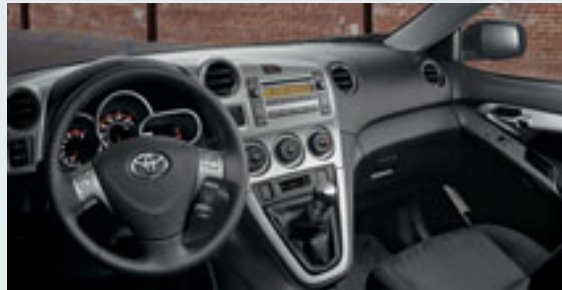
XRS interior shown in Dark Charcoal with available JBL® audio system [20].