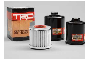
TRD Oil Filter $13 Parts Only MSRP**