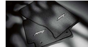
Carpet Floor Mats (5pc. set) $200 Installed MSRP*