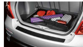
Cargo Net $51 Installed MSRP*