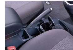
Ashtray Cup $26 Installed MSRP*