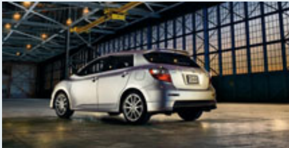
XRS shown in Classic Silver Metallic