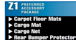
Preferred Accessory Package $330 Installed MSRP*