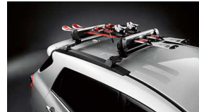
Ski/Snowboard Attachment with Mounts $194 Parts Only MSRP**