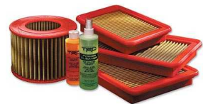
TRD Air Filter $65 Parts Only MSRP**