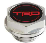
TRD Oil Cap $57 Parts Only MSRP**