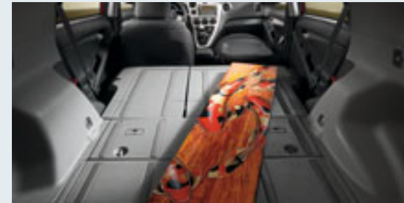
S interior shown in Dark Charcoal with front passenger and rear seats folded flat S and XRS only.