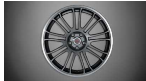
TRD 18-in. Multi-Spoke Wheel $255 Parts Only MSRP**