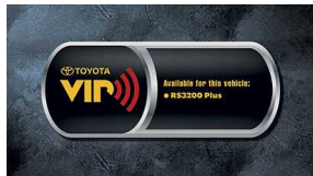
VIP Security System $359 Installed MSRP*