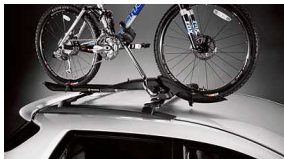
Bike Attachment with Mounts $244 Parts Only MSRP**