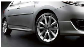
Body Side Moldings $209 Installed MSRP*