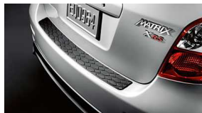
Rear Bumper Protector $79 Installed MSRP*