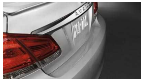
Rear Bumper Applique $69 Installed MSRP*