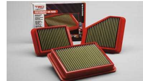
TRD Air Filter $60 Parts Only MSRP**