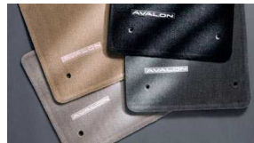
Carpet Floor Mats $199 Installed MSRP*