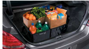
Cargo Tote $40 Installed MSRP*