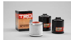
TRD Oil Filter $13 Parts Only MSRP**