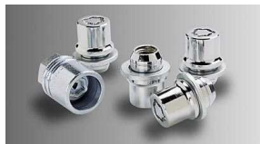
Wheel Locks (alloy) $67 Installed MSRP*