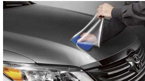
Paint Protection Film $395 Installed MSRP*