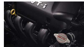
TRD Radiator Cap $37 Parts Only MSRP**