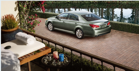
Avalon shown in Cypress Pearl with available voice-activated touch-screen DVD navigation system. [10]