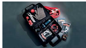
Emergency Assistance Kit $70 Installed MSRP*