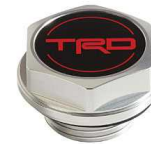
TRD Oil Cap $45 Parts Only MSRP**