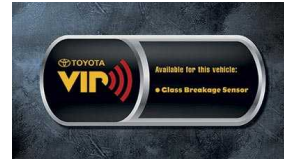
Glass Breakage Sensor $165 Installed MSRP*