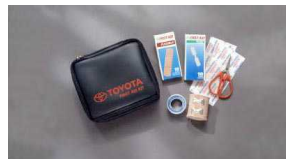
First Aid Kit $29 Installed MSRP*