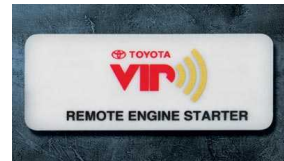
Remote Engine Starter $499 Installed MSRP*