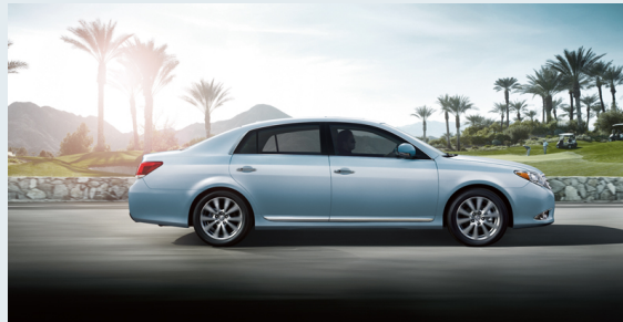
Limited shown in Zephyr Blue Metallic.