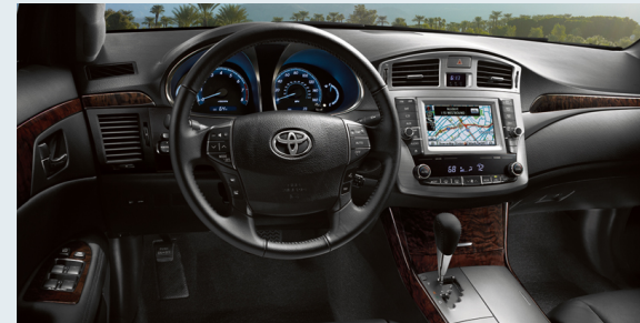
Avalon shown in Black leather with available voice-activated touch-screen DVD navigation system. [10]