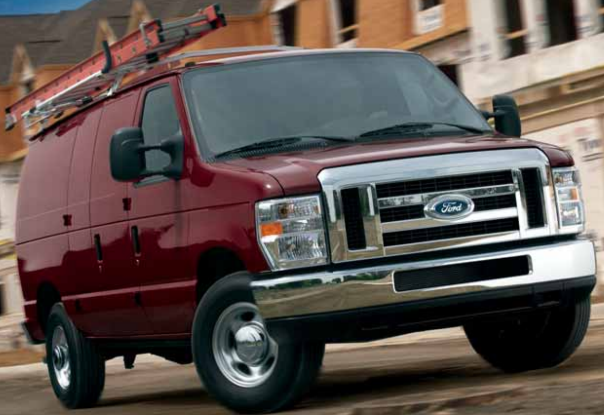
E-250 Cargo Van in Royal Red with available and aftermarket equipment