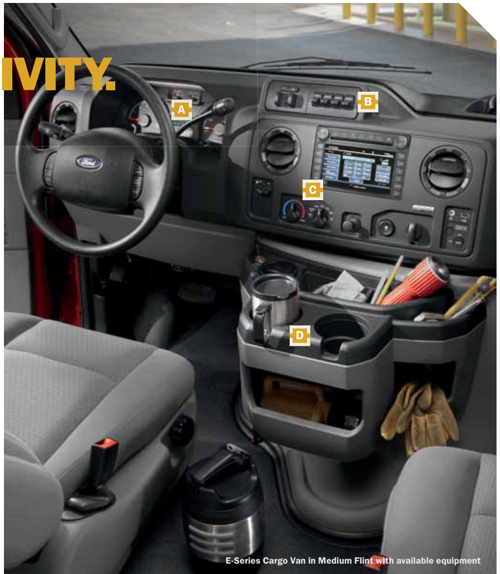
E-Series Cargo Van in Medium Flint with available equipment

This standard feature gives you lots of storage capacity within easy reach. The upright storage bin is large enough to hold clipboards or even some laptops.