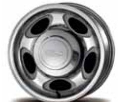
16-in. Aluminum Wheels Available